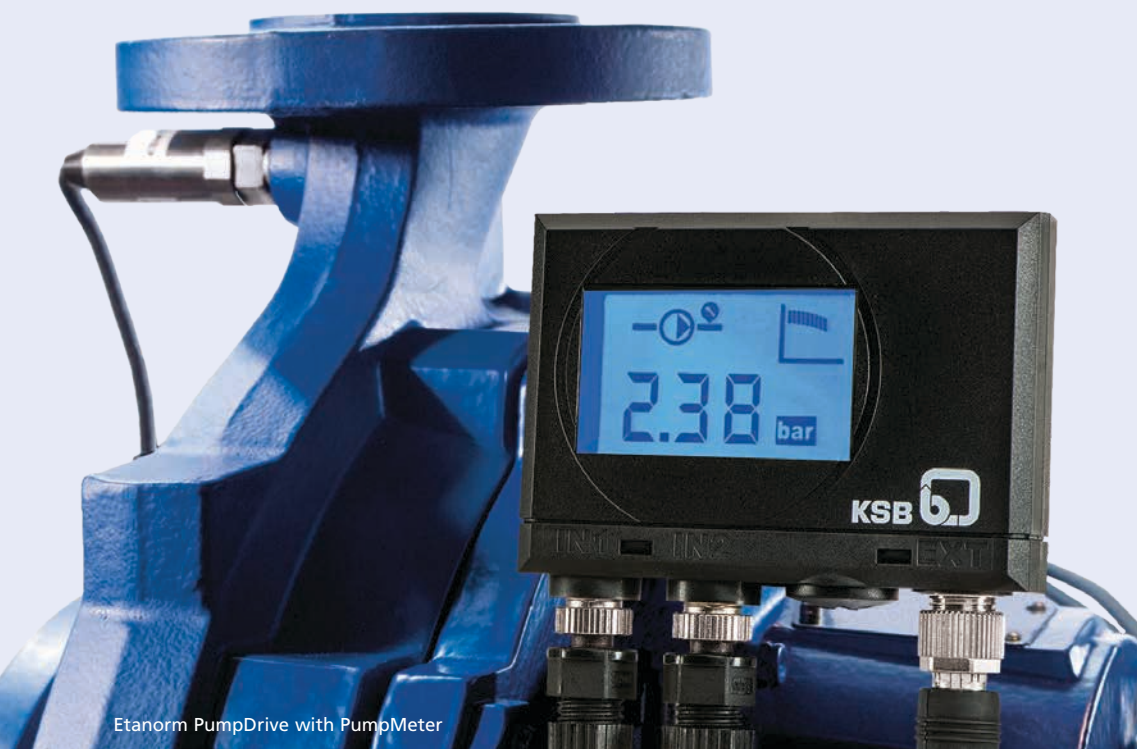
Etanorm PumpDrive with PumpMeter