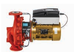
Etaline PumpDrive with KSB SuPremE® and PumpMeter