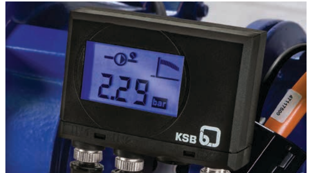
KSB experts will help you to interpret the operating data and to make use of potential energy savings.