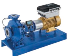
Etanorm PumpDrive with KSB SuPremE® and PumpMeter