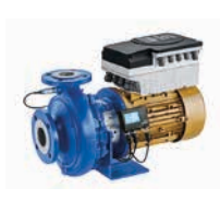
Etabloc PumpDrive with KSB SuPremE® and PumpMeter