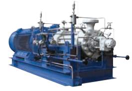
High-pressure ring-section pump BB4: HG, HGM, HGI