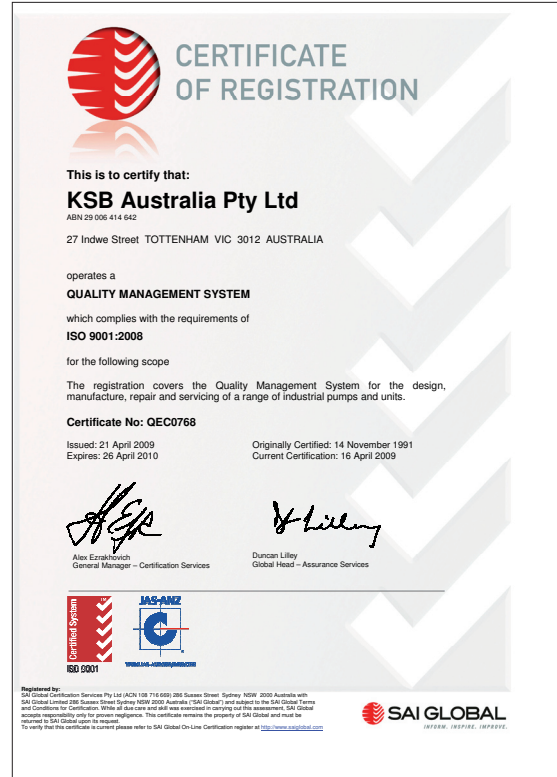
KSB-Service – certified quality standards